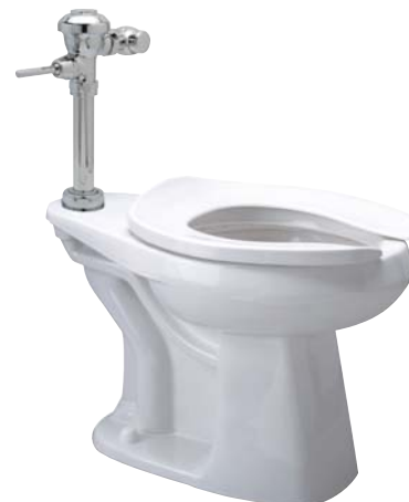
Z5655 Series Elongated (shown with seat)