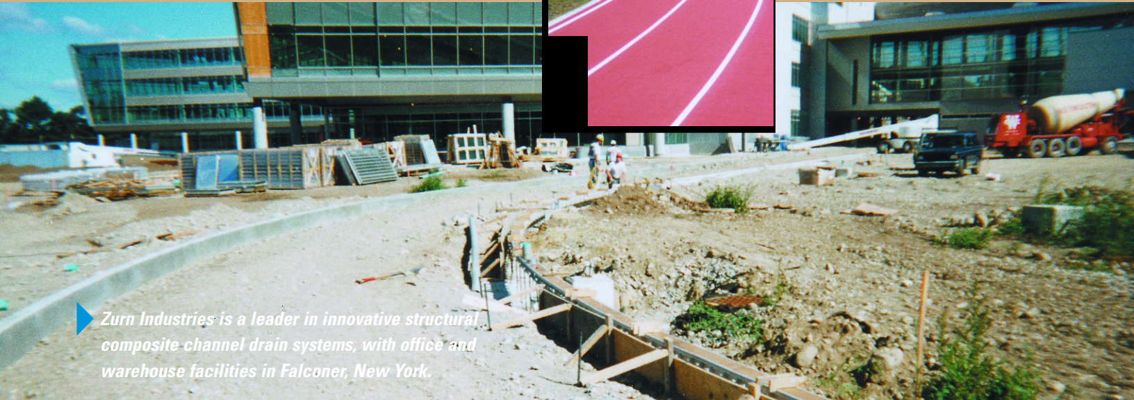
Zurn Industries is a leader in innovative structural composite channel drain systems, with office and warehouse facilities in Falconer, New York.