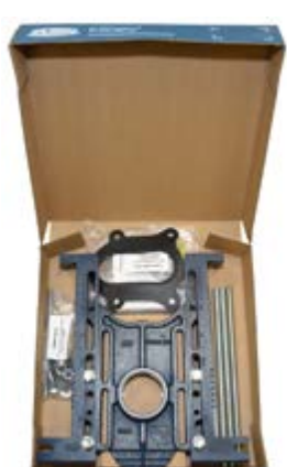
Labor-saving packaging with organized rough-in and finish part packs reduce lost parts. Pre-assembled at 5-1/2" standard rough-in to speed up adjustment time.

Ask your Zurn representative for performance paired solutions or visit zurn.com.