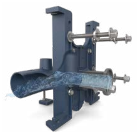
Engineered waterway optimizes flow, creating best-in-class line carry.