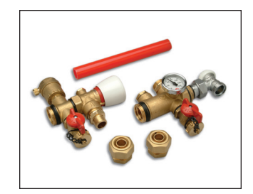
Pressure By-pass Kit for 1" Manifolds