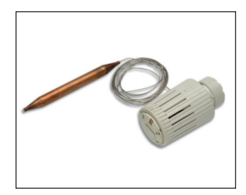
Thermostatic Control for Injection Pump Kit