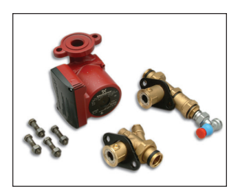
Injection Pump Kit for 1" Manifolds