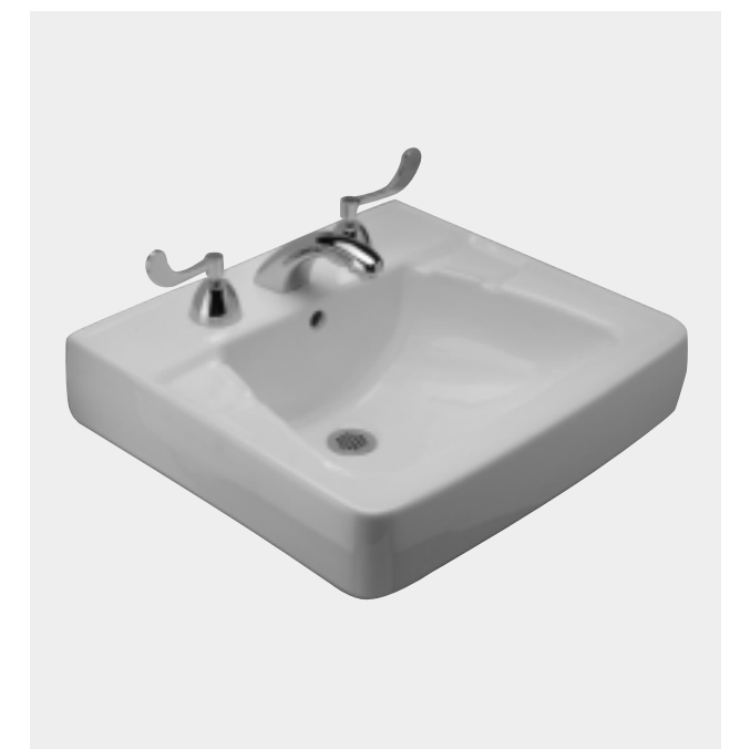
Z5310 Series 20" x 18" wall hung lavatory shown with Z831R4 faucet (sold separately).