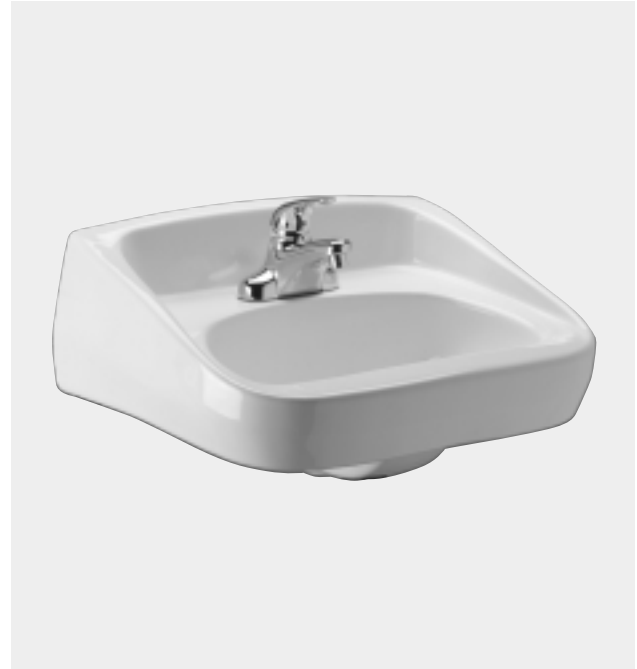
Z5360 Series 20" x 18" high back wall hung lavatory shown with Z7440 Sierra faucet (sold separately).

See Zurn One Systems for suggested packages.