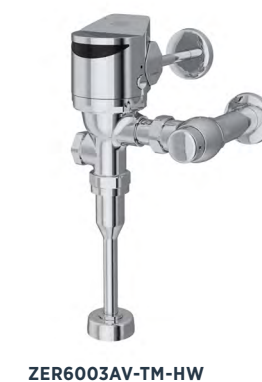
HARDWIRED FLUSH VALVES WATER CLOSETS GPF ZER6000AV-ONE-TM-HW 11 ZER6000AV-HET-TM-HW 1.28 ZER6000AV-WS1-TM-HW 1.6 ZER6000AV-DF-TM-HW 1.1/1.6 URINALS GPF ZER6003AV-ULF-TM-HW 0.125 ZER6003AV-EWS-TM-HW 0.5 ZER6003AV-WS1-TM-HW 1.0