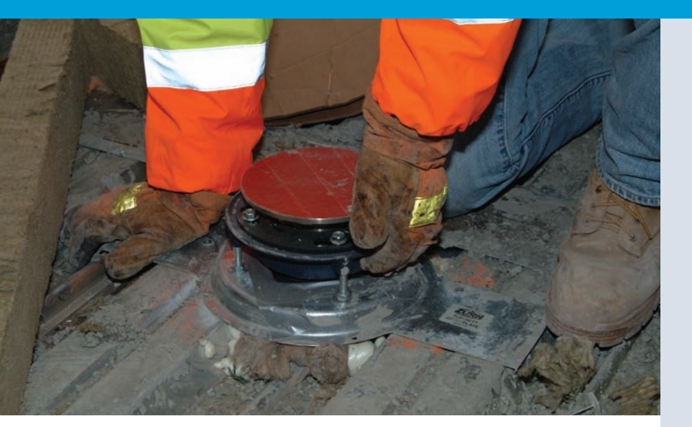
Project MVPs - Most Valuable Products

For successful, sustainable plumbing solutions, MLP Plumbing relied heavily on five specific Zurn products to help save labor and cut costs.