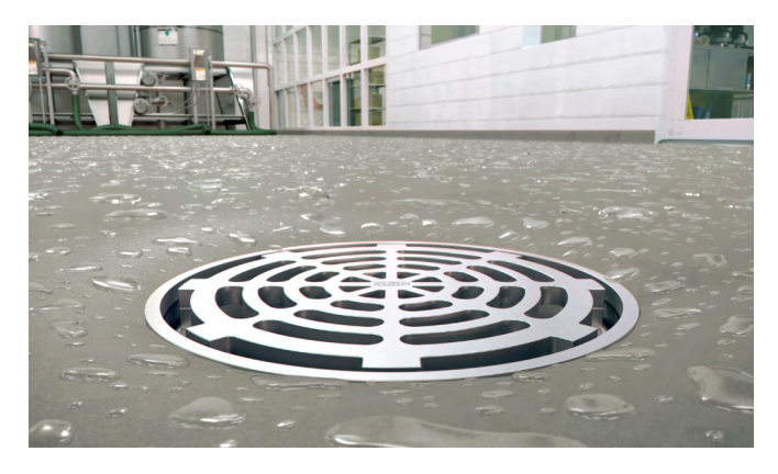
Standard -H5 Extra Heavy-Duty Slotted Grate

Create a more sanitary environment with fewer drain issues to worry about. The Zurn Z1805 Industrial Standard Sanitary Floor Drain is designed to reduce areas where bacteria can collect. The proprietary seamless body construction and sloped bottom design are engineered for free-flowing drainage to reduce the risk of standing water in the bottom of the drain. The Z1805 is available in round or square and with multiple configuration options for the versatility and durability of one drain that fits numerous applications.