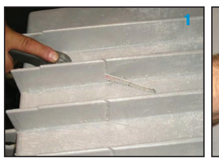
1. Place outlet onto catch basin in required location. Mark top and bottom of outlet onto ribs. Cut ribs with handsaw.