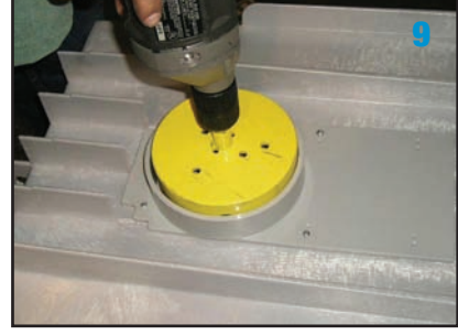
9. Once outlet is firmly secure, drill outlet/catch basin hole with a hole saw.

Finished product (left). Approximate total time to assemble: 10-15 minutes.