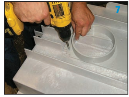
7. Once outlet is placed, attach outlet with supplied screws.

6. Apply construction adhesive to outlet and place in required position.