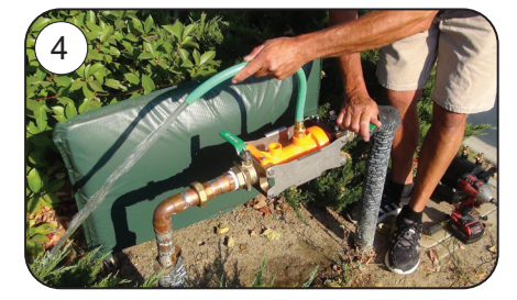
Turn on inlet ball valve, direct water to landscaping or safe drain, and flush until clear