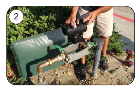
Un-bolt and remove EZSwap™ Pressure Vessel.