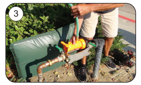
Drop in and install Flush Fitting Tool. Attach hose.