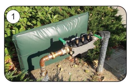
Backflow is installed with ball valves in the closed position

Simple Line Flushing with the 300 Series Flush Fitting Tool 1-1/2" 375XL shown