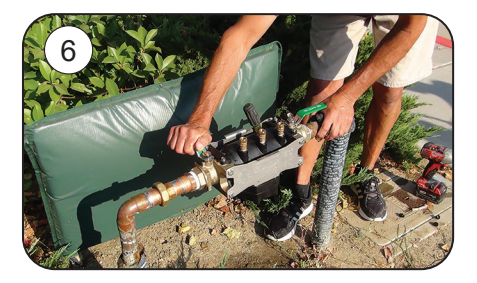
Commission the backflow and start up system.