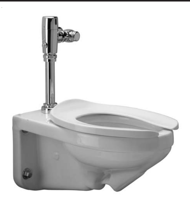
Z5615 Series Elongated