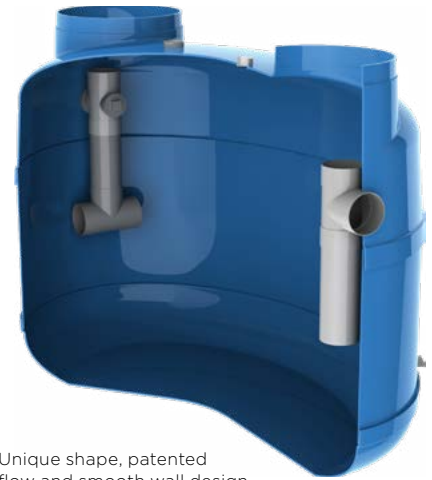
Unique shape, patented flow and smooth wall design for best performance and lowest maintenance

And since no two businesses are alike, you have design assistance before you get started on your project. We customize configurations to work where other interceptors wouldn't fit or last over time.