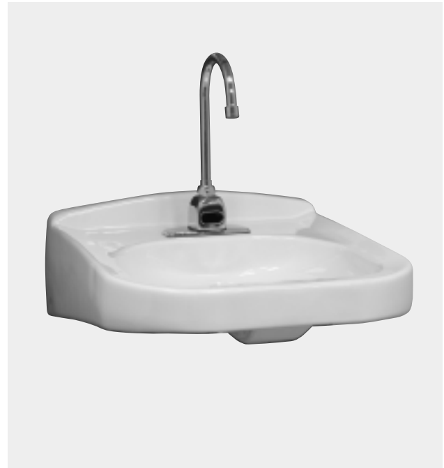
Z5320 Series 20" x 23" wheelchair lavatory shown with Z6920-CP4 gooseneck sensor faucet (sold separately).

See Zurn One Systems for suggested packages.