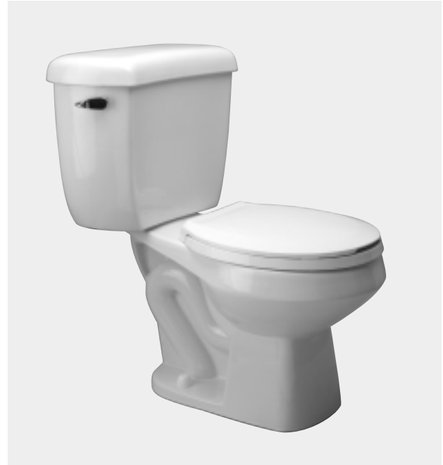
Z5575 pressure assist two-piece toilet. Shown with Z5958SS-RD toilet seat (sold separately).