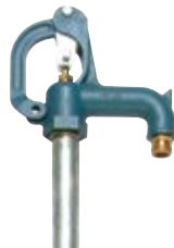
Z1388 Roof Hydrant