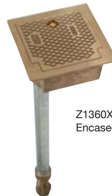
Z1360XL Encased Ground Hydrant