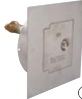
Z1332XL-EZ Encased Wall Hydrant