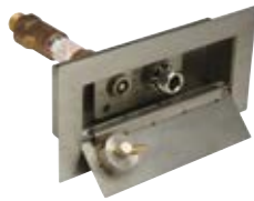
Z1320XL-EZ Encased Wall Hydrant