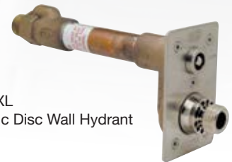
Z1321XL Ceramic Disc Wall Hydrant