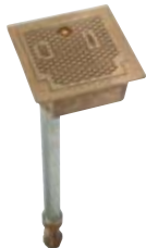
Z1360XL Encased Ground Hydrant