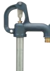
Z1395XL Yard Hydrant