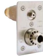
Z1333XL Wall Hydrant