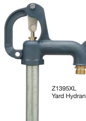
Z1395XL Yard Hydrant