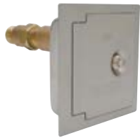
Z1320XL Encased Wall Hydrant