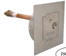
Z1322XL-EZ Encased Wall Hydrant