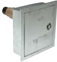
Z1330XL Encased Wall Hydrant