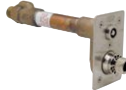
Z1321XL Wall Hydrant