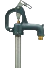
Z1397XL Flo-Trol Yard Hydrant