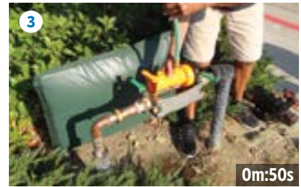
Drop in and install Flush Fitting Tool. Attach hose.