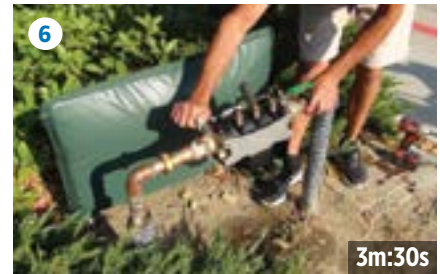
Commission the backflow and start up system.