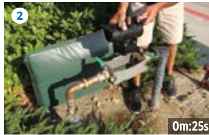
Un-bolt and remove EZSwap™ Pressure Vessel.