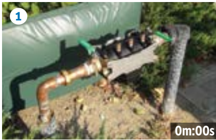
Backflow is installed with ball valves in the closed position.