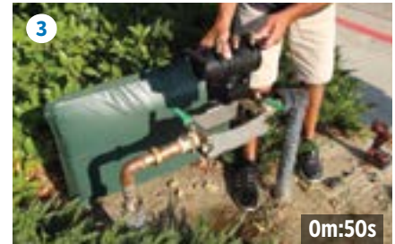
3 Remove EZSwap Pressure Vessel from backflow.