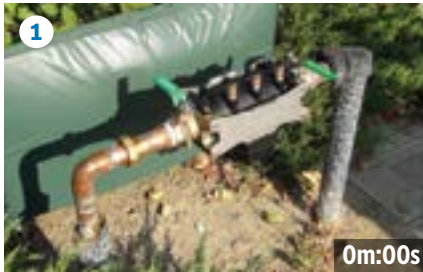
1 Valve is installed in-line. Turn shut-off valves to shut down system.