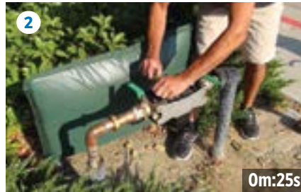
2 Unscrew and remove wedge, or un-bolt.