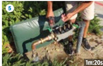
5 Reinstall or replace EZSwap Pressure Vessel and wedge.