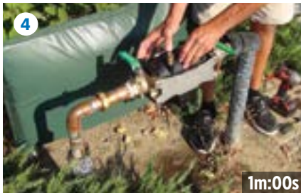
4 Drop in replacement EZSwap Pressure Vessel.