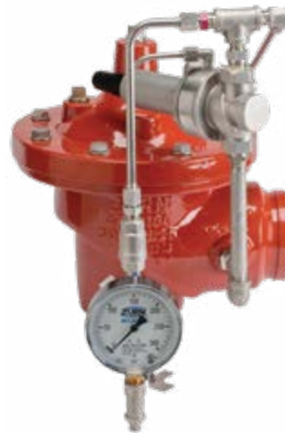
ZW205FPA with "SP" option - stainless steel pilotry