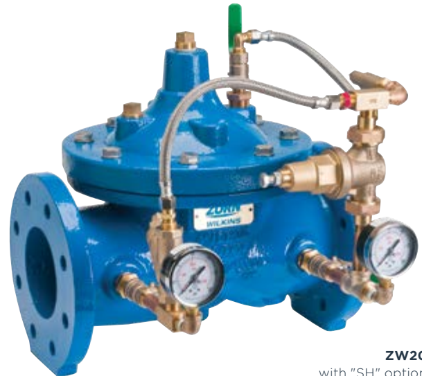
ZW209 with "SH" option - stainless braided hose