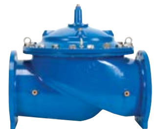
1-1/4" - 16" available