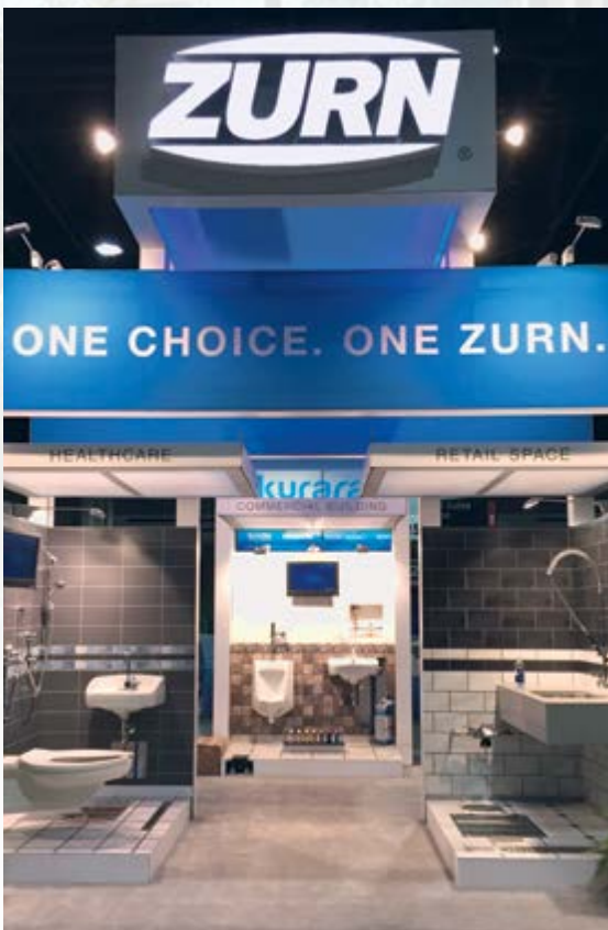
Zurn Trade Show Booth

At Zurn we are committed to providing smart solutions that save both time and money. Our goal is serving the customer through innovation, continuous improvement, and assurance behind every installation. Choose Zurn for a reliable, recognized manufacturer to supply your entire installation, from behind the wall rough-in to finish trim product and fixture systems. Visit Zurn.com for more information on our entire breadth of products.