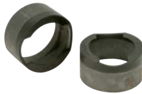
QickCap® Crimp Ring