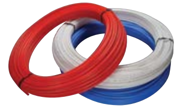
Zurn PEX® Non-Barrier Tubing