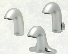
Patented and Patents Pending

The Z6950-XL Aqua-FIT Sensor Faucet offers new patent-pending Flexible Installation Technology, making retrofit upgrades simple and cost effective. With just one simple tool, you can replace the faucet spout or change to a completely new design without having to work below the deck.