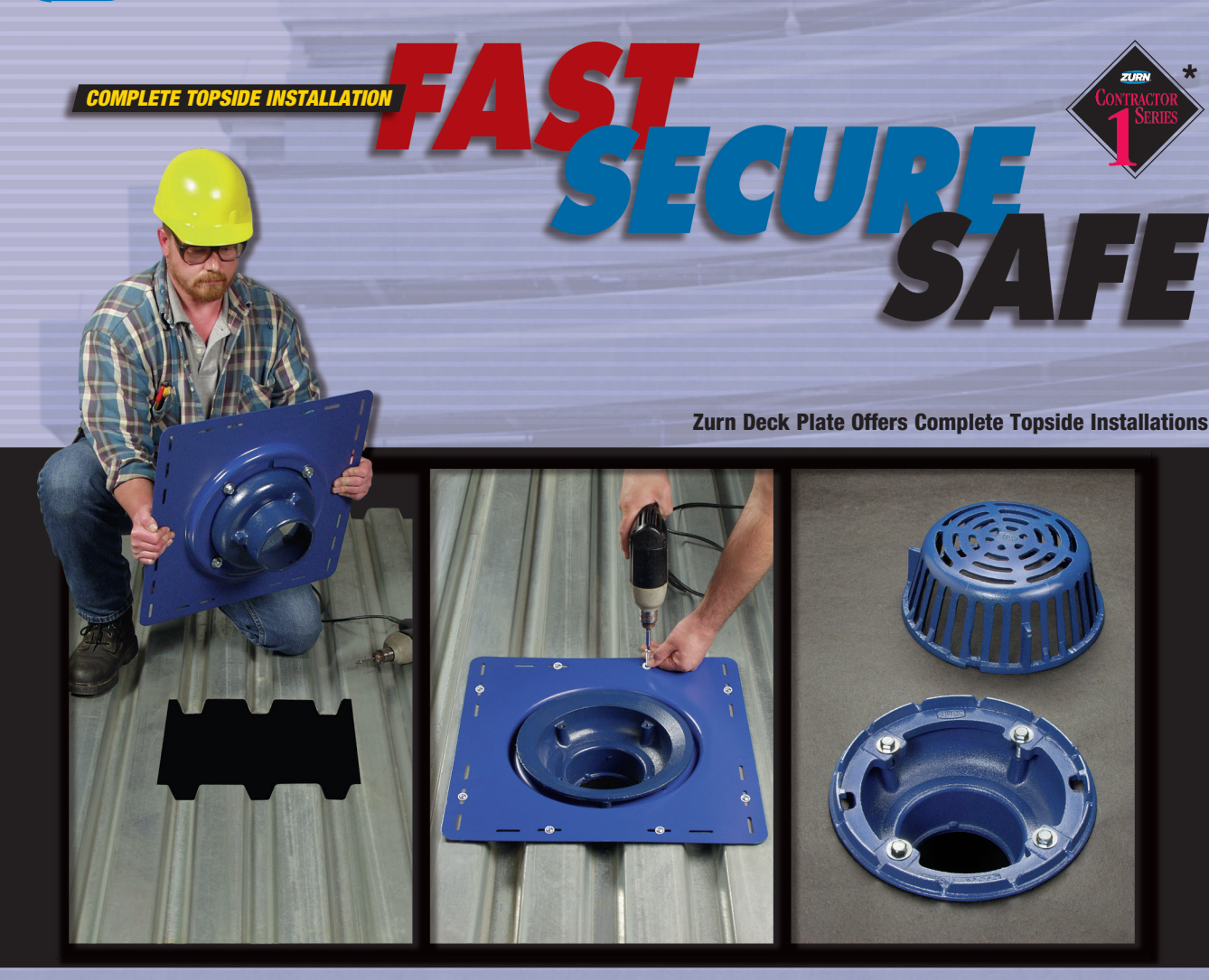
Preassemble Drain Body To Deck Plate