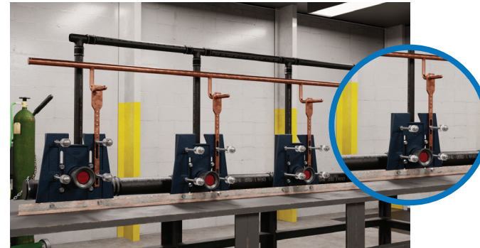
Angle Iron Installation