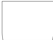
92417001 (F) 55/64-27 Female

Engineering Specifications: Zurn AquaSpec® 92417001, 92418001 1.0 GPM (3.8 L) Pressure Compensating Spray Outlet (Complying with ASME A112.18.1/CSA B125.1).