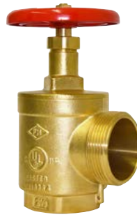
212-F100 FNPT x NH