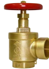
112-F100F FNPT x FNPT