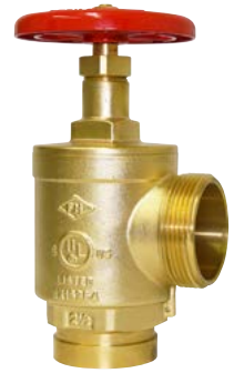
212-F100G Grooved x NH