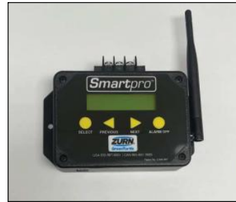
G4 CONTROL PANEL